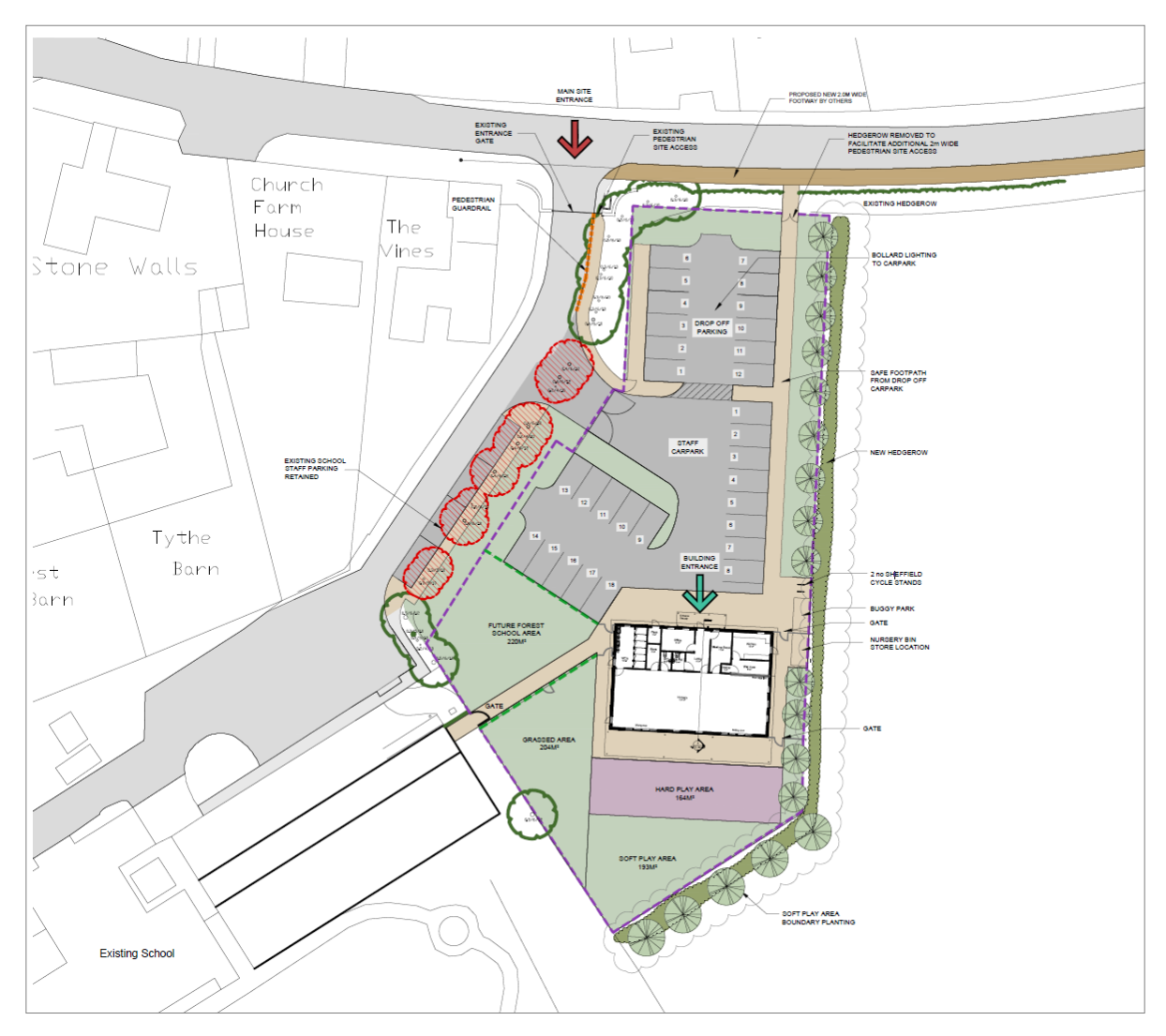
Figure 2: Layout of the Development